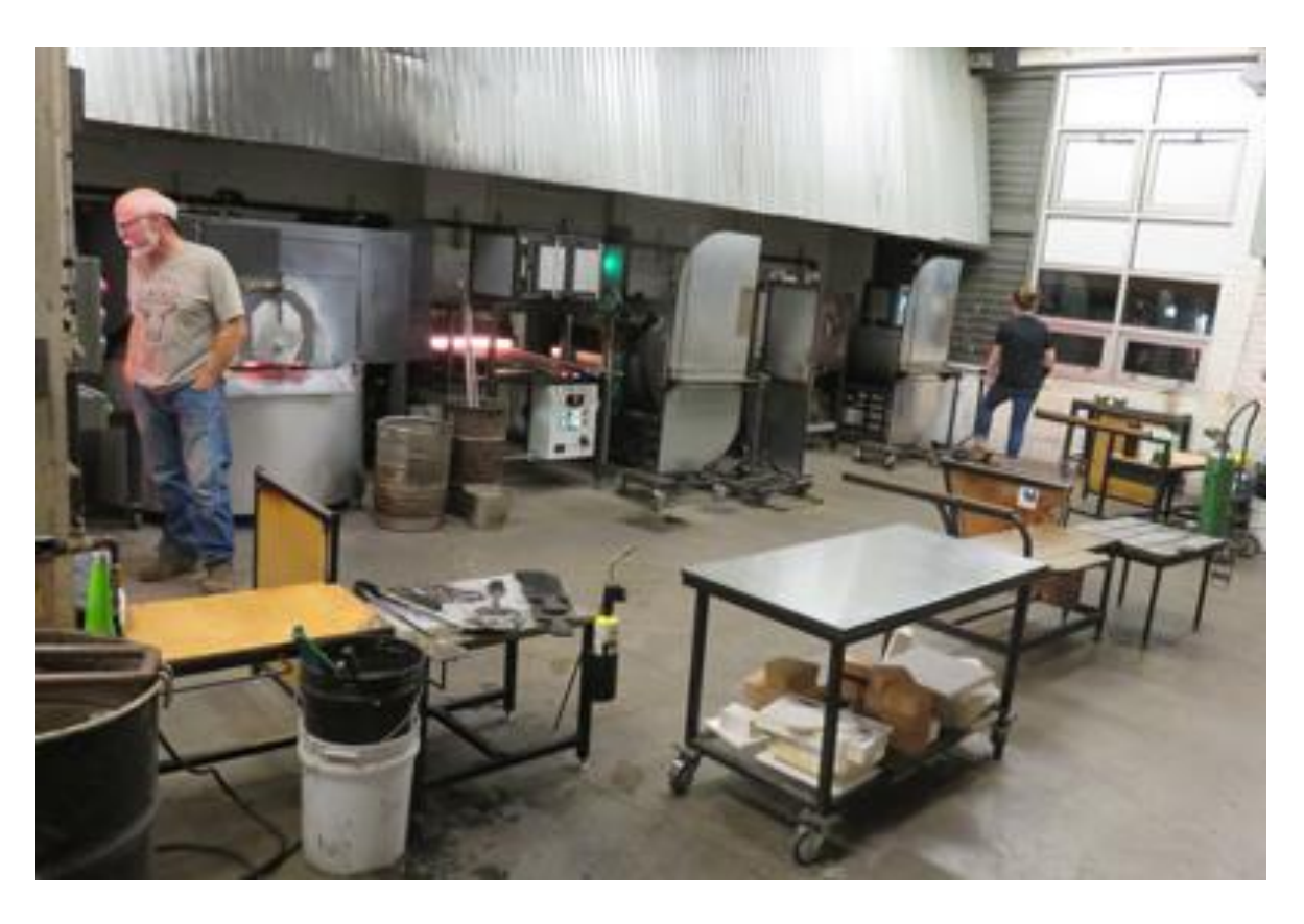
Hot Glass Shop