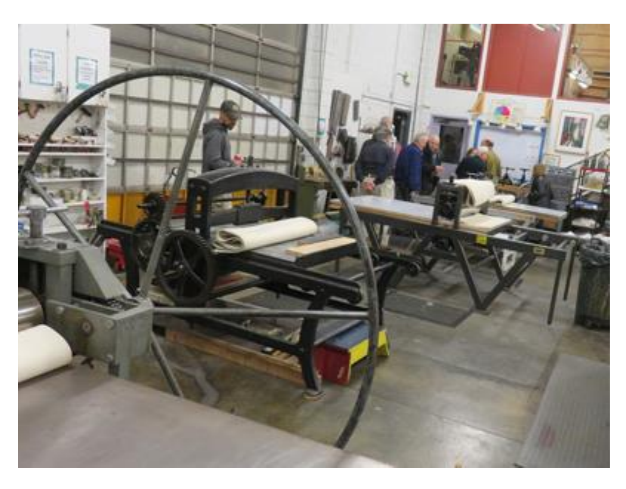
Printing and Textile Studio